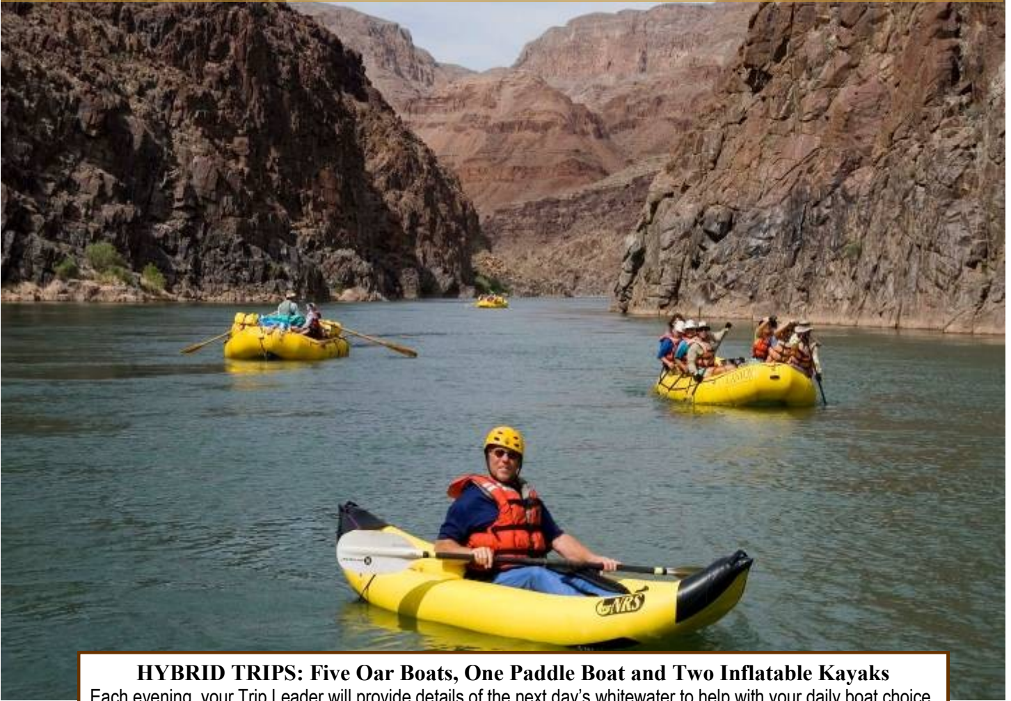
HYBRID TRIPS: Five Oar Boats, One Paddle Boat and Two Inflatable Kayaks Each evening, your Trip Leader will provide details of the next day's whitewater to help with your daily boat choice.